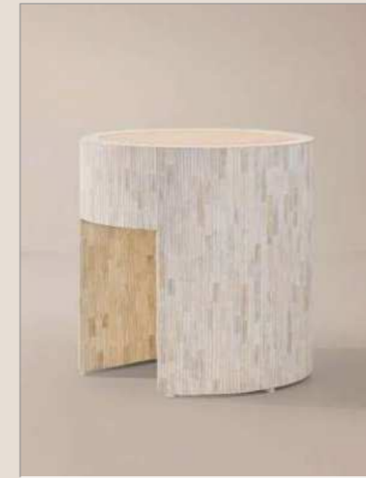
BEAUMONT INLAY SIDE TABLE

DIMENSIONS : L 72.5 cm W 75 cm H 70.6 cm MATERIAL : VELVET, STAINED OAK