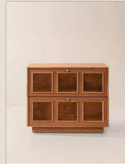
BASTILLE BURL BEDSIDE TABLE

DIMENSIONS : L 175 cm W 46.5 cm H 82.5 cm MATERIAL : ENGINEERED WOOD, NATURAL OAK, BURL VENEER, ANTIQUE GOLD FINISH