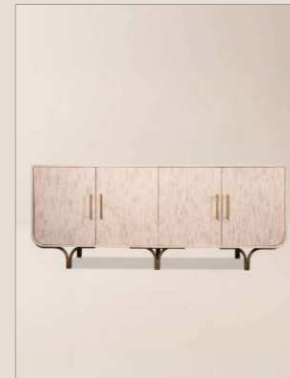
SORELLE INLAY CREDENZA

DIMENSIONS : L 48.5 cm W 60 cm H 107 cm MATERIAL : VELVET, NATURAL OAK COLOUR : MUSTARD