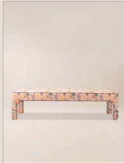
VICTOIRE UPHOLSTERED BENCH

DIMENSIONS : L 168 cm W 45.7 cm H 43.1 cm MATERIAL : POLYLINE UPHOLSTERY, VELVET BORDER COLOUR : SOLID