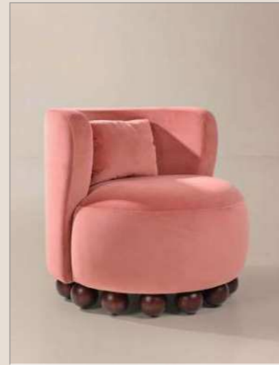
TOULOUSE BALL BASE CHAIR

DIMENSIONS : L 107.95 cm W 67.31 cm H 36.83 cm MATERIAL : SPANISH EMPERADOR & METAL TOP &ENGINEERED WOOD BASE