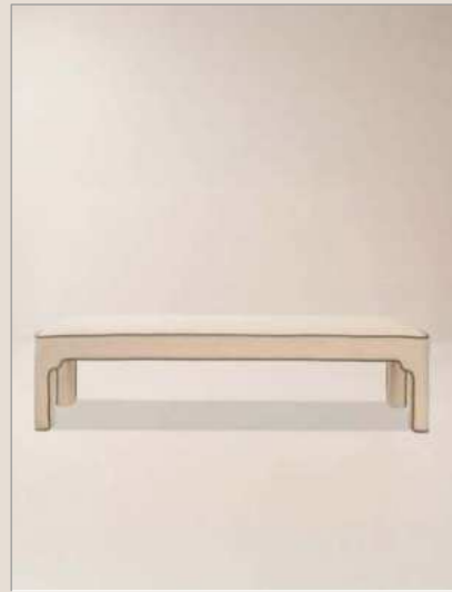
VICTOIRE UPHOLSTERED BENCH

DIMENSIONS : L 168 cm W 45.7 cm H 43.1 cm MATERIAL : POLYLINE UPHOLSTERY, VELVET BORDER COLOUR : SOLID