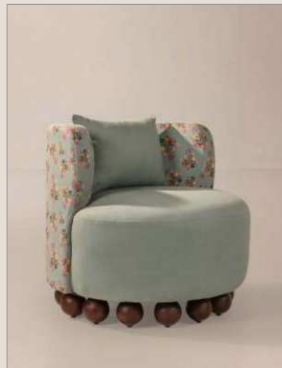
TOULOUSE BALL BASE CHAIR

DIMENSIONS : L 48.5 cm W 60 cm H 107 cm MATERIAL : BOUCLE, STAINED OAK COLOUR : CHOCOLATE BROWN