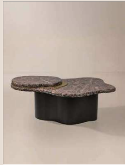
ÉTAGE COFFEE TABLE

DIMENSIONS : L 200 cm W 87 cm H 79.3 cm MATERIAL : TEXTURED VELVET UPHOLSTERY, SOLID VELVET UPHOLSTERY & SS SKIRTING IN ANTIQUE BRASS FINISH