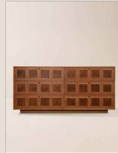
BASTILLE BURL SIDEBOARD

DIMENSIONS : L 152.5 W 51 cm H 82.5 cm MATERIAL : ENGINEERED WOOD STRUCTURE, SUEDE SHUTTERS, LACQUERED TOP, OAK FINISH, BRASS