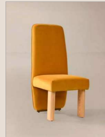
ELYSÉE HIGHBACK DINING CHAIR

DIMENSIONS : L 140 cm W 63.5 cm H 43 cm MATERIAL : CHISELED CAMEL BONE RESIN INLAY, NATURAL OAK TOP