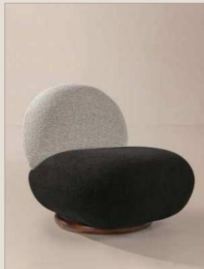
BALUSTRE SWIVEL ARMCHAIR

DIMENSIONS : L 72.5 cm W 75 cm H 70.6 cm MATERIAL : POLYLINE, STAINED OAK