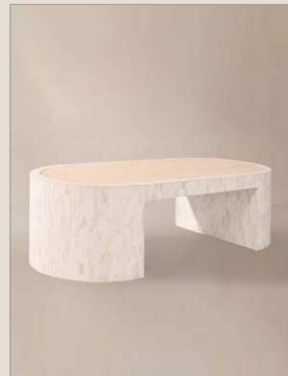
BEAUMONT INLAY COFFEE TABLE

DIMENSIONS : L 86.3 cm W 92.7 cm H 81.2 cm MATERIAL : HEATHERED BOUCLE & BOUCLE UPHOLSTERY, STAINED OAK BASE