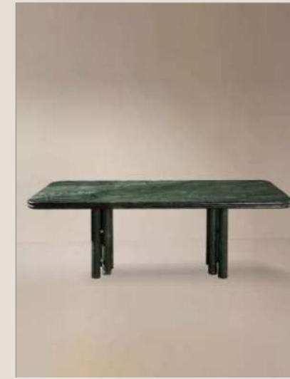
ETERNA DINING TABLE

DIMENSIONS : L 50.8 cm W 50.8 cm H 50.8 cm MATERIAL : CHISELED CAMEL BONE RESIN INLAY, NATURAL OAK TOP