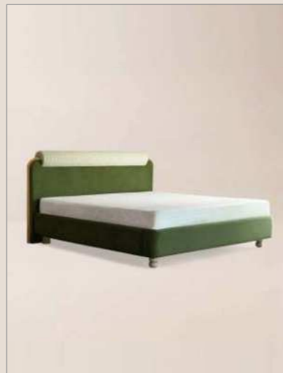
ÉMERAUDE BOLSTER BED

DIMENSIONS : L 63.5 cm W 43 cm H 43 cm MATERIAL : ENGINEERED WOOD STRUCTURE, SUEDE SHUTTERS, LACQUERED TOP, OAK FINISH