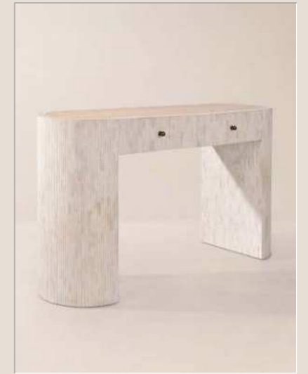
CLEMENT INLAY CONSOLE

DIMENSIONS : L 63.5 cm W 42 cm H 51 cm MATERIAL : ENGINEERED WOOD, NATURAL OAK, BURL VENEER, ANTIQUE GOLD FINISH