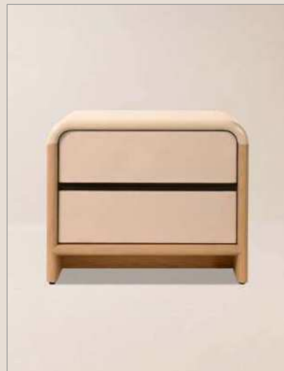
NOEMIE BEDSIDE TABLE

DIMENSIONS : L 150 cm W 45 cm H 33.46 cm MATERIAL : CAMEL BONE INLAY BASE, NATURAL OAK TOP