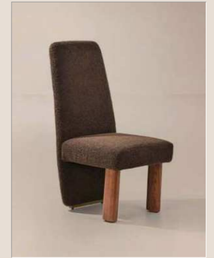
ELYSÉE HIGHBACK DINING CHAIR

DIMENSIONS : L 218.5 cm W 101 cm H 76 cm MATERIAL : GREEN MARBLE, BRASS