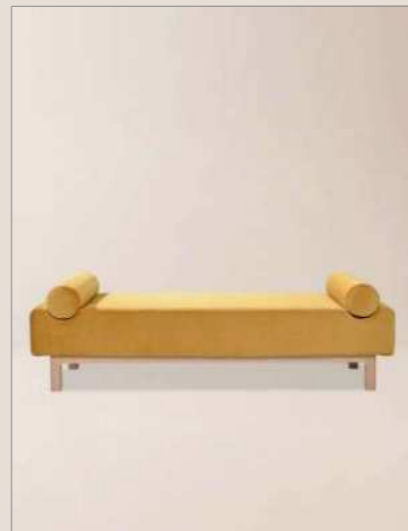
AURORA UPHOLSTERED BENCH

DIMENSIONS : L 200.7 cm W 201.3 cm H 109.2 cm MATERIAL : VELVET & POLYLINEN UPHOLSTERY, OAK WOOD LEGS